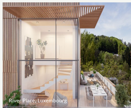
River Place, Luxembourg