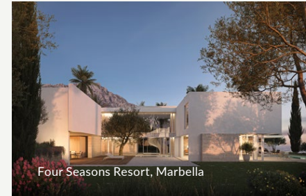
Four Seasons Resort, Marbella